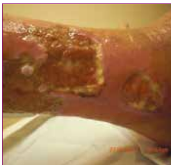
Example of an exuding wound.

It is also important to treat the underlying wound aetiology and any intrinsic factors that might increase exudate production. Aetiologies associated with increased exudate are wound infection, oedema or underlying medical conditions, such as heart failure or lymphoedema (Stephen-Haynes, 2011). The following wound types produce high levels of exudate: leg ulcers, fungating wounds, burns, infected wounds and postoperative dehisced wounds (Gardner, 2012).